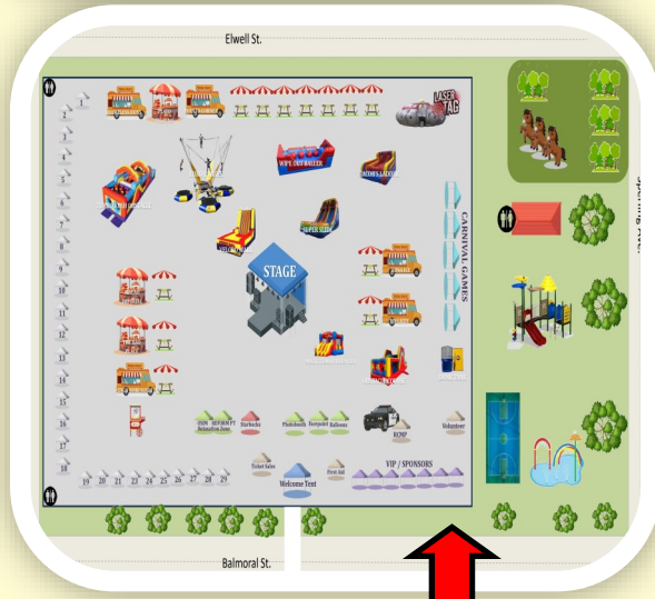
MAP OF ATTRACTIONS